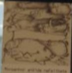
Neuron and the neural circuit

(Please note: After Social Field Study Publications start in 2010, exchange space rights are shared to institutions and individuals who use Field Study in a non-profit organization and all content must be provided back into the Field Study project.)