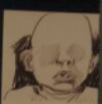
Neuron and the neural circuit

051 530 502 332 www.gene.kanagawa-u.ac.jp/~lab/field-study 1-10-10 HIRAKAWA, JR.